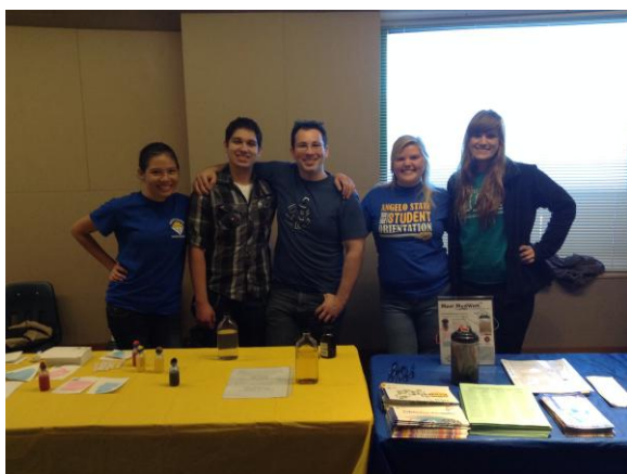
San Angelo Eco-Fair

In celebration of Mole Day, on October 22 the students in the ACS club at ASU made their annual "Periodic Table of Cupcakes," which consists of cupcakes frosted with the symbols for all of the chemical elements (and a few fictional ones, such as unobtainium and dilithium).