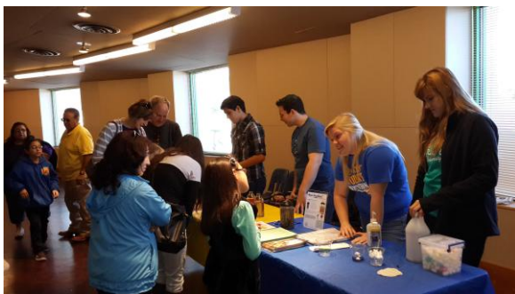
San Angelo Eco-Fair