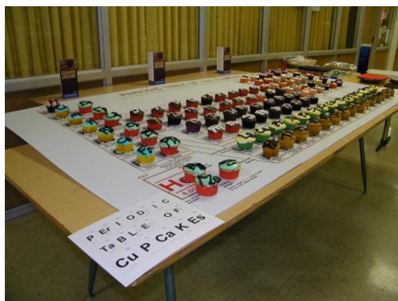
Periodic Table of Cupcakes