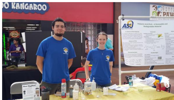
Sunset Mall Community Day