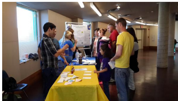
San Angelo Eco-Fair